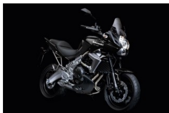
Metallic Spark Black / Metallic Flat Spark Black