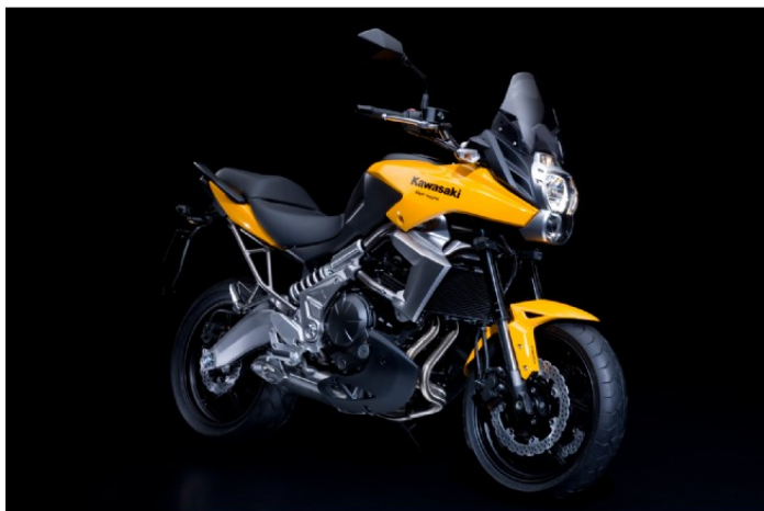
Model Year 2010