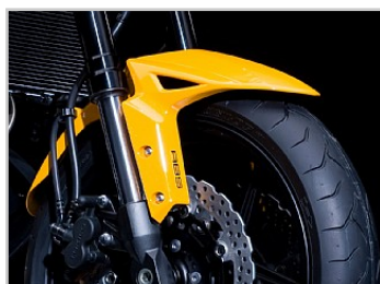
Long travel suspension