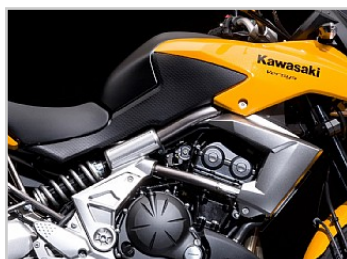
Upright riding position