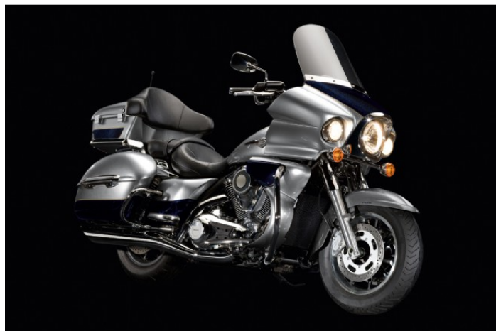
Model Year 2010