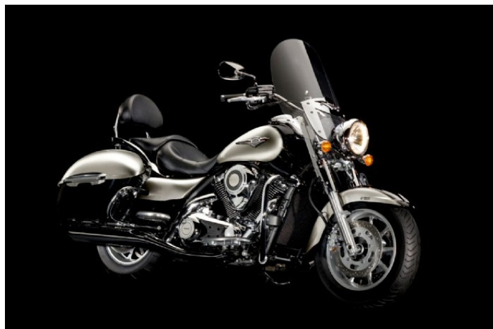
Model Year 2010