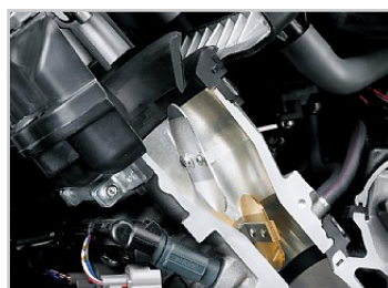
Precise throttle control