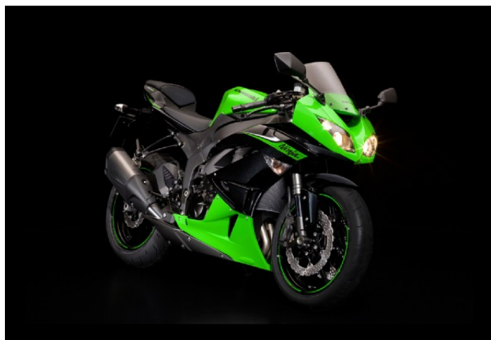
Model Year 2010