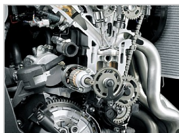
Strong mid-range power